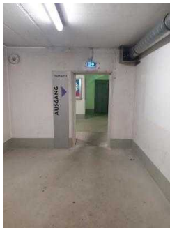
Corridor on floor 5 of the underground car park