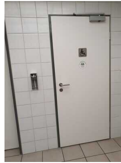
Public WC for people with disabilities in the underground car park, floor 5