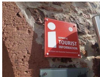
Tourist Information Lohr am Main