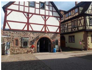
Tourist Information Lohr am Main