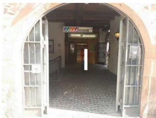
Corridor in the entrance area: round arch – lift/stairs to the underground car park – tourist information office