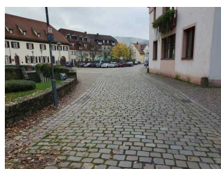
Path from the parking lot for people with disabilities to the tourist information office