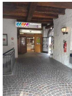
Corridor in the entrance area: round arch – lift/stairs to the underground car park – tourist information office