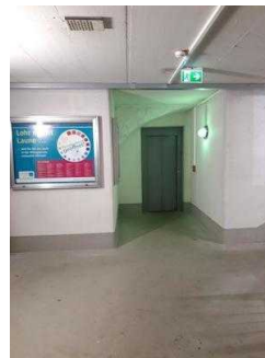
Corridor on floor 5 of the underground car park