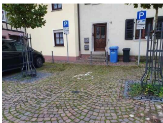
Parking lot for people with disabilities