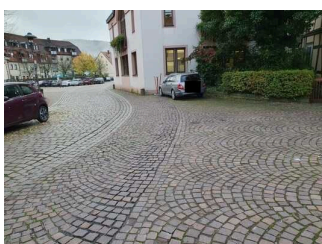
Path from the parking lot for people with disabilities to the tourist information office